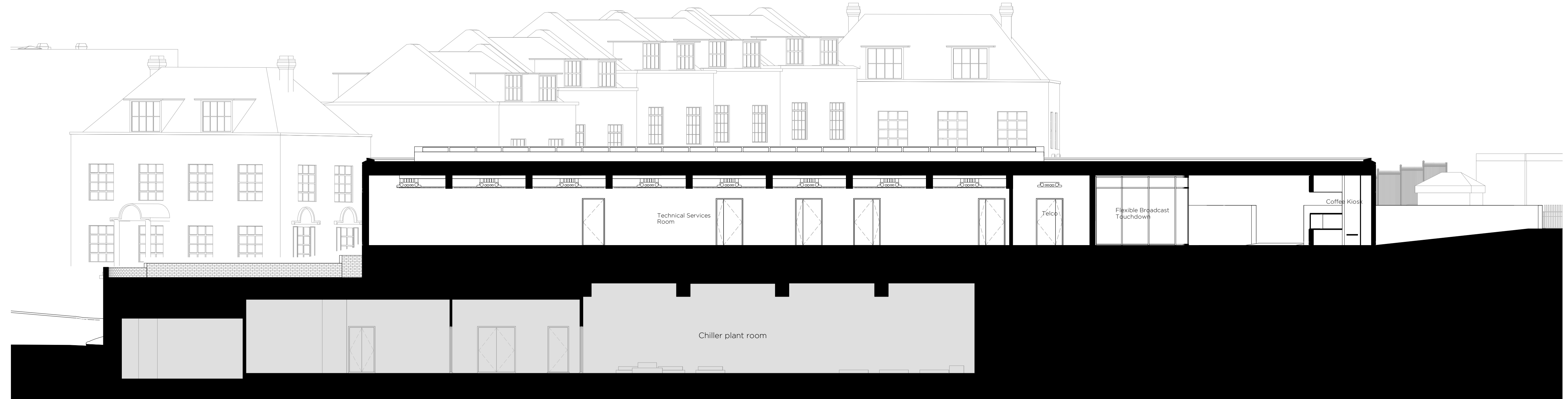
1 | Proposed GA Section - CC